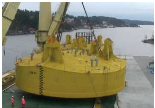
Jack-up rig leg "spud can" removed for maintenance

Shortly after starting the operation, the dive supervisor saw the attendant at the bottom of the ladder collapse. On seeing this, the supervisor impulsively climbed down the ladder to assist, without wearing a B.A set . Before he could reach the attendant, he too collapsed. The alarm was raised and the ventilation rate was increased to drive out the "sour gas" from inside the spud can. As soon as this was done, a large quantity of gas emerged out of the narrow opening of the spud can and the "stand by" person was affected and collapsed.