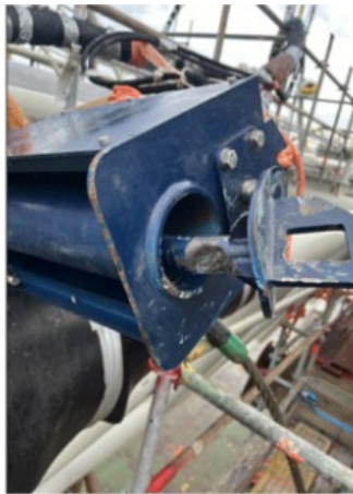
Bent connection plate